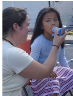
Proper inhaler techniques are essential in treating asthma

St. Louis was given a score of 95.45, with worse than average pollen and air quality.