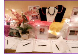
Auction items sold fast at the 2011 Orchid Affair

If you or an organization you are part of, would like to host an event to bring attention to AAFA’s efforts in our community, we’d love to hear your ideas and work with you!